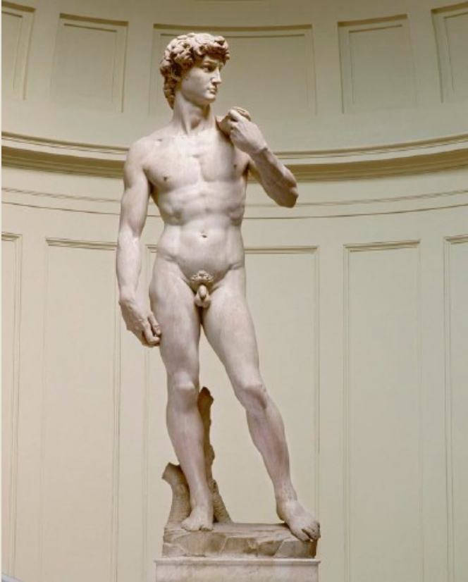
Statue of David