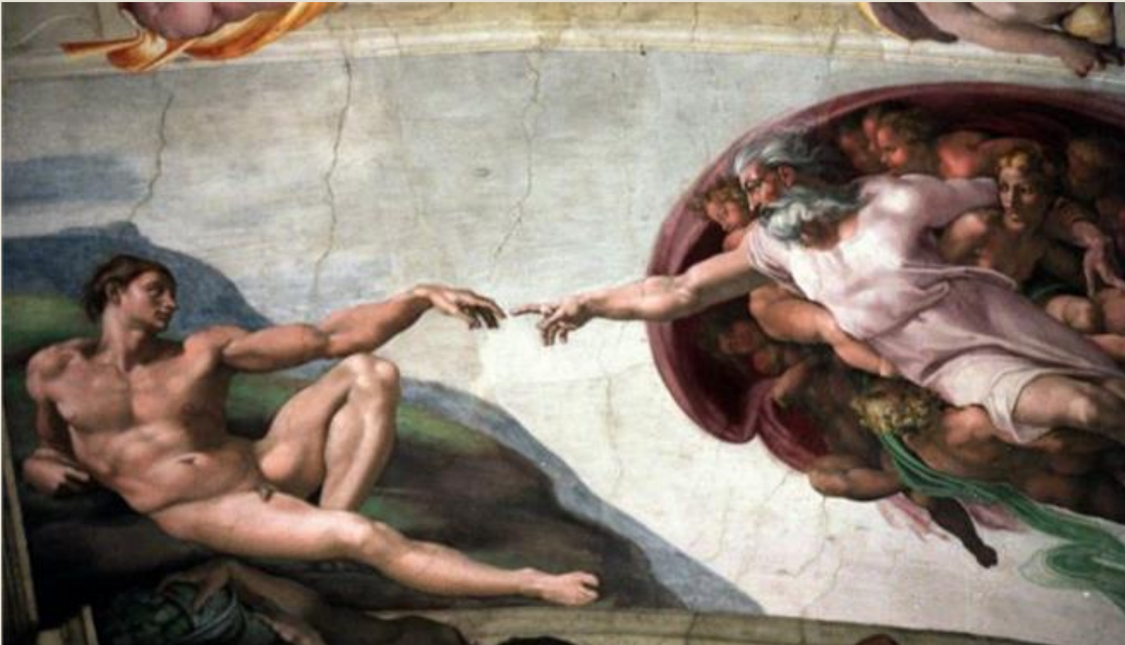
Creation of Adam