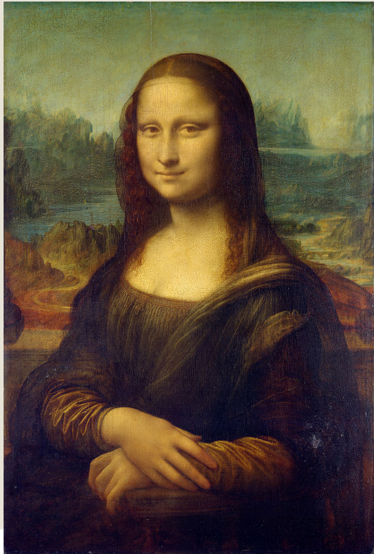
The Mona Lisa